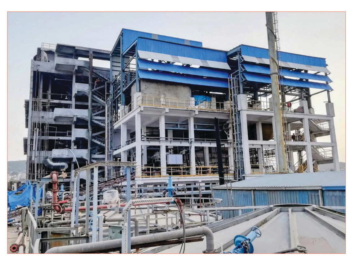
Aluminium Fluoride Plant, Visakhapatnam